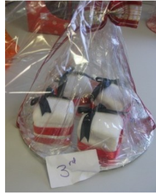
3 rd - Megan Curtis