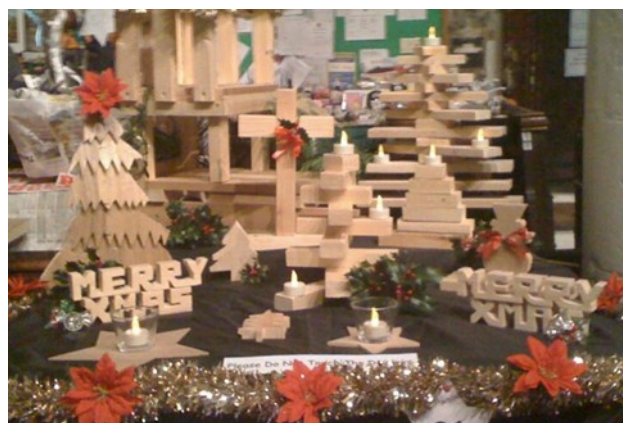
Handmade carpentry and joinery display decorated by Year 11 BTEC Vocational Studies

Our Christmas tree entry was built in traditional wood, reflecting the Christmas theme, a tree, candle pieces, a cross and Merry Xmas. It was produced by the students who were proud to be a part of the fifth tree festival.